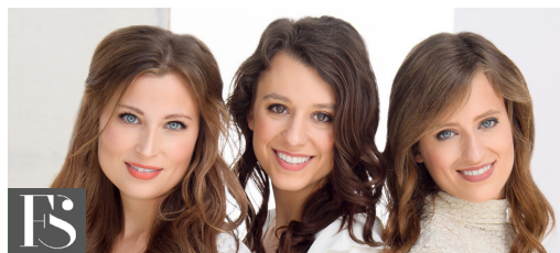
Foto Sisters Christmas Concert, Wednesday, November 20, 7 pm. The talented sisters we love so much will be back from Nashville to perform a Christmas program in our Sanctuary. Admission is free; a love-offering will be taken.